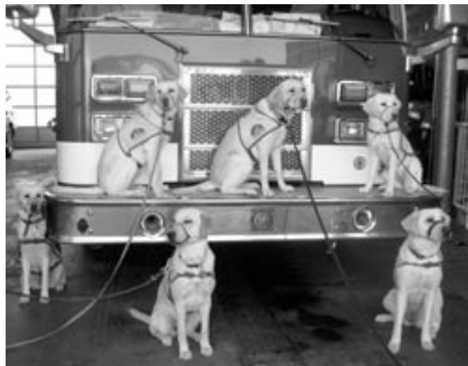
New Mexico puppies in program visited a fire station on a field trip.

Move over and stop for emergency vehicles with Canine Companions puppies on board! During a recent training outing,