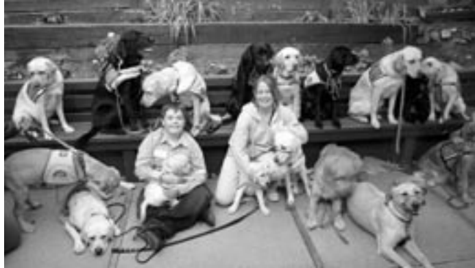
Graduates, puppy raisers and volunteers gathered for a Wasatch Champions potluck dinner in October.