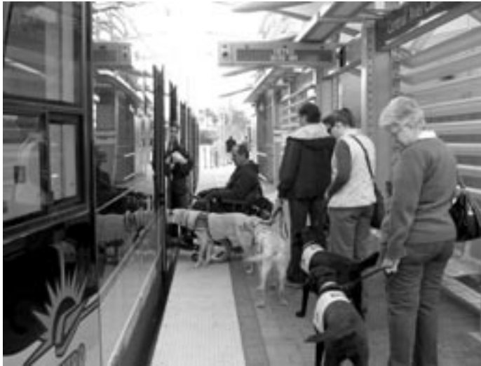
Arizona puppy raisers gather for the opportunity to ride the Valley Metro Light Rail with their puppies in program.

raisers had an adventurous day of riding the Valley Metro Light Rail and mingling with the crowds at the Phoenix Convention Center. Graduate Gary Frandino planned the outing, including an escort from Valley Metro and free passes for all. Our puppies not only learned how to ride the rail, but also got to experience big crowds, traffic noise, strange dogs and crowded elevators.