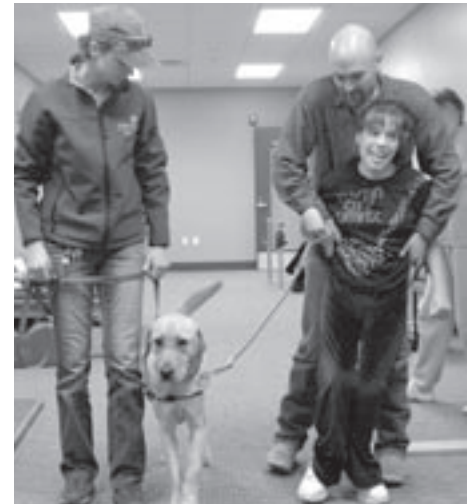
Facility Dog Emerson II motivates the Shea Center's clients to push themselves in their physical therapy.